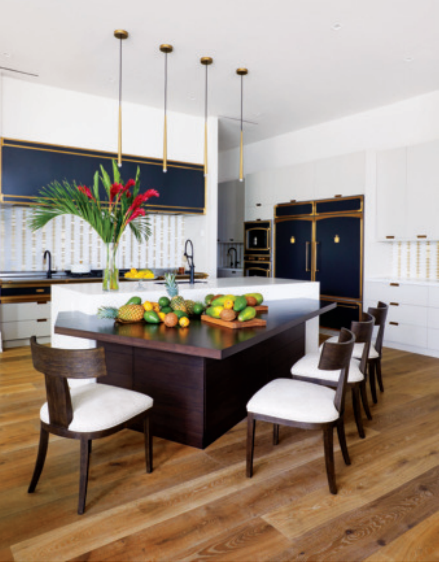
ABOVE RH PENDANT LIGHTS HANG ABOVE A TRAPEZOIDAL TABLE. OFFICINE GULLO APPLIANCES; BRIZO SINK FITTINGS; CAESARSTONE COUNTERTOP.

high-end features with warm woods and casual touches that complement Serena's laid-back vibe resulted in a cohesive visual narrative that embodies Serena's newly evolved design aesthetic, which Haffey calls "livable luxury," adding that the client was a well of creativity, serving up references from hotels she's stayed at all over the world.